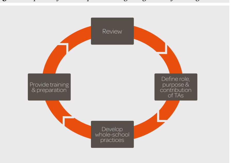
Figure 3. A process of school improvement regarding the use of teaching assistants

Figure 3 shows a model for school improvement that SLTs have previously found useful in reviewing the current use of TAs and guiding a process of change. This should shape an action plan for your school, which can then act as a foundation for training and deploying staff. Importantly, training should include supporting teachers in how to work effectively with TAs.